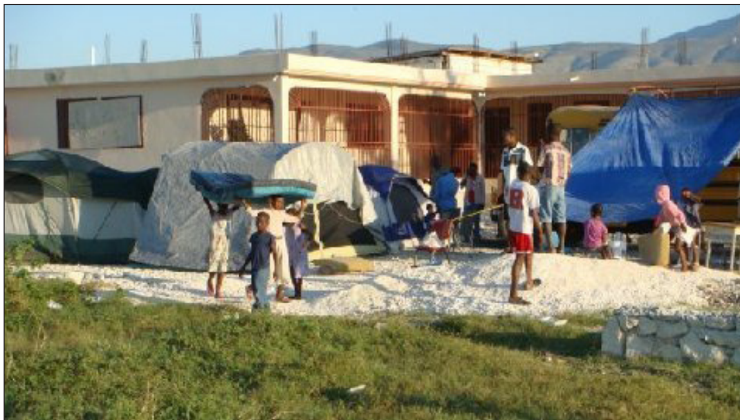
My Father's House Orphanage

"Even though I walk through the valley of the shadow of death, I will fear no evil..." – Psalm 23:4a