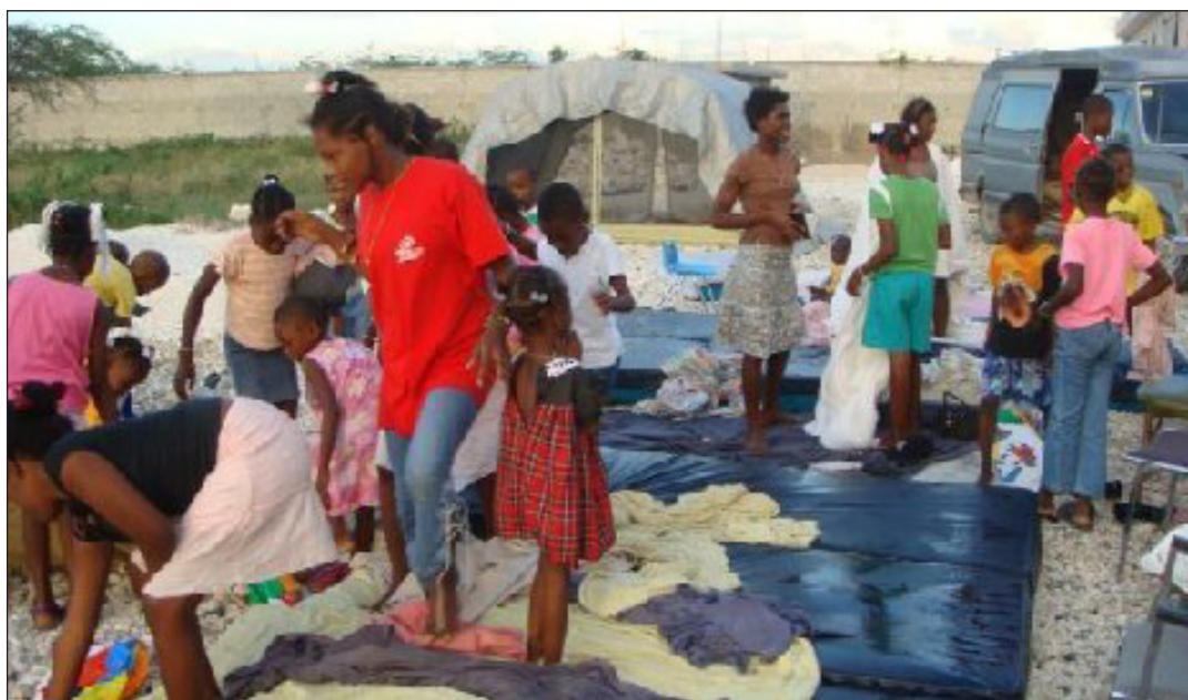
Setting up camp