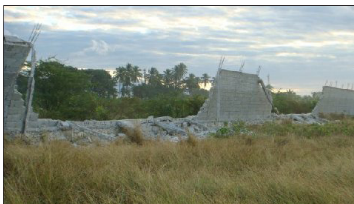
The broken security wall around the orphanage.