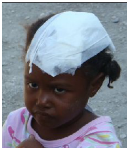
Waiting for our medical team to arrive