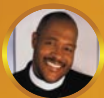
Wed., Oct. 6 PASTOR MARVIN WINANS Perfecting Faith Church Detroit, MI

All services will be held at Calvary @ 7:30 pm