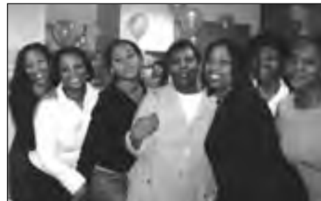
Here are some of the TLC young ladies and the ministry leaders at their kick-off meeting.

"As being a leader in this ministry it is a pleasure and a blessing to be apart of the lives of our youth. As our journey continues with