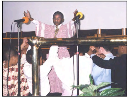
Some of our young ones performing in this year's Easter Program.