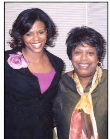
These Mother's Day Brunch attendees were all smiles.