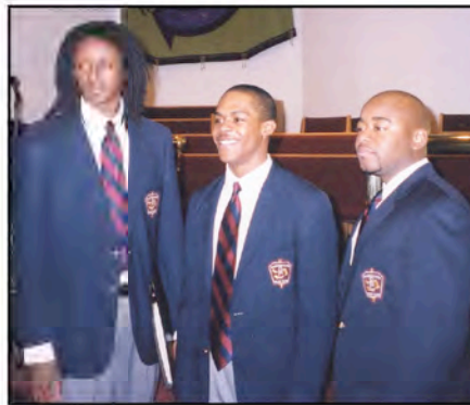
A few young men from the Morehouse Glee Club performance at Calvary.