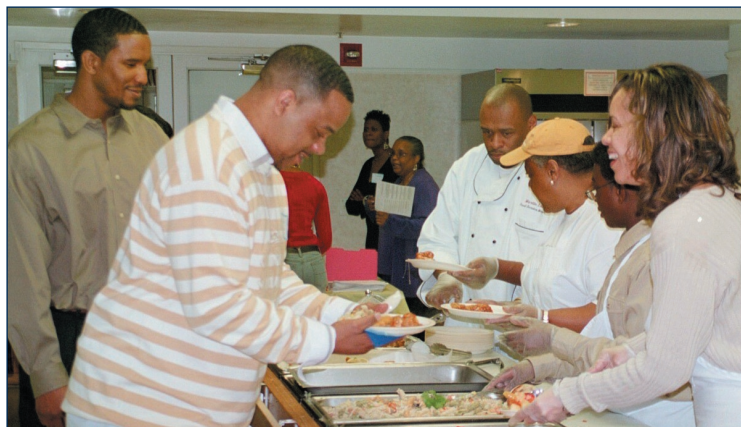
New members were officially welcomed to Calvary at the Agape Feast